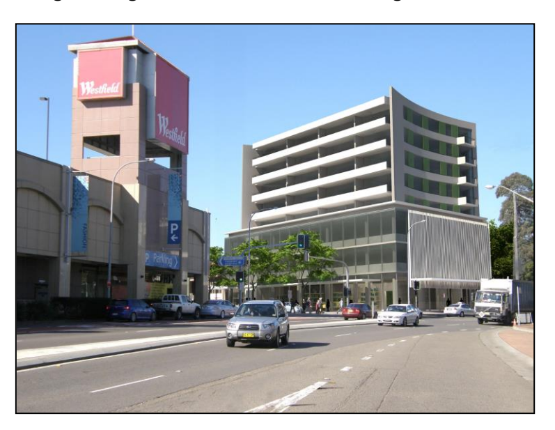
Figure 2: Approved Development on the Subject Site

Off-street car parking was approved for 86 vehicles within a three (3) level basement structure, accessed via a combined entry/exit driveway located along the Edgeworth David Avenue frontage of the site.